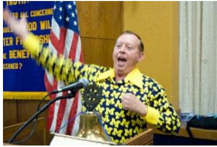
Jim Irwin--need we say more?