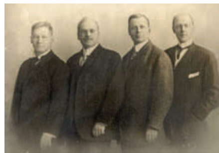
The first four Rotarians: ( from left) Gustavus Loehr, Silvester Schiele, Hiram Shorey, and Paul P. Harris

As Rotary grew, its mission expanded beyond serving club members' professional and social interests. Rotarians began pooling their resources and contributing their talents to help serve communities in need. The organization's dedication to this ideal is best expressed in its motto: Service Above Self.