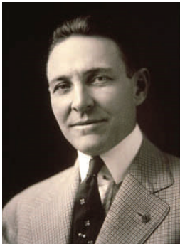
Arch C. Klumph, founder of The Rotary Foundation, circa 1916

In 1917, RI President Arch C. Klumph proposed that an endowment be set up "for the purpose of doing good in the world." In 1928, when the endowment fund had grown to more than US$5,000, it was renamed The Rotary Foundation, and it became a distinct entity within Rotary International.